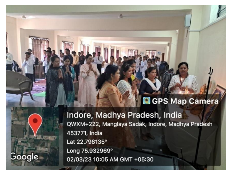
Figure 6 Dhanwantari Vandana by faculty members and students

Day started with prayers to Lord Dhanwantari in presence of faculty members and students.